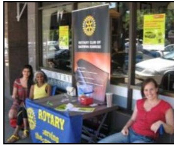
Selling raffle tickets at the Parap markets an easy $3000 fundraiser