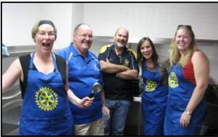
The 'morning team' at the Supreme Court Open Day café.