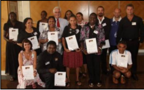
The Five Category Winners and Runners Up