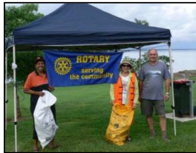
Just three of the many at Clean Up Australia at East Point.