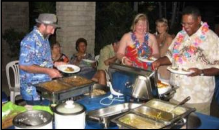
A Club Progressive dinner - what a great fun way of raising money.