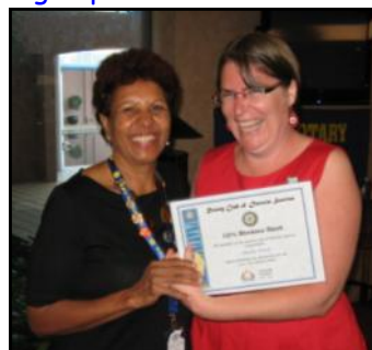
Ainslie was just one of 13 members to receive 100% Attendance Awards.