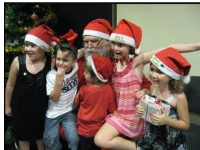
A very popular Santa at our Sailing Club Christmas party