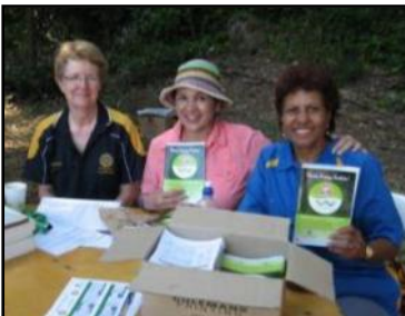
A happy trio of 'Gate Keepers' doing duty at the Gardens Spectacular